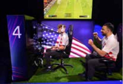
using its name for the next decade to an eye-watering $2.5 billion. Despite these reported claims, one thing is sure, there

In 2022, after 30 years of making FIFA games together, the world football governing body and video game developer and publisher EA Sports, announced they were splitting up. It was acrimonious. The specific details about what caused the split will likely be kept under a non-disclosure agreement forever. However, according to a 2021 New York Times report citing insider knowledge, EA Sports allegedly wanted more rights as part of any new deal, and FIFA allegedly wanted to double the fee for