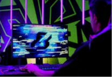
qualifier to Gamers8: The Land of Heroes. It begins with a StarCraft II tournament, a new addition to the GWB, running from April 14 to 23 and featuring 24 players. The next competition, a first for the GWB, will be an all-women (CS:GO) tournament, with six teams

RIYADH (Agencies): Gamers Without Borders, the world's largest charitable esports event, is set to kick off today with a total charity prize pool of $10 million. The GWB's 2023 edition will benefit six aid partners — Direct Relief, IMC, UNICEF, King Salman Humanitarian Aid and Relief Center, World Food Programme and the UN-HCR. Organized by the Saudi Esports Federation and sponsored by strategic partner Aramco and presenting partner Savvy Games Group, the event's fourth edition features five elite competitions across four of the world's most popular esports titles. The GWB six-week mega-series will serve as a