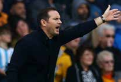
ons League quarter-final first leg on Wednesday. Chelsea are languishing in 11th place in the Premier League

LONDON (Agencies): Frank Lampard has urged Chelsea to ignore the turmoil enveloping his struggling side as he invoked the memory of the Blues' incredible run to Champions League glory in 2012. Lampard is back in charge of Chelsea until the end of the season after replacing the sacked Graham Potter last week. After watching Chelsea crash to a lacklustre 1-0 defeat at Wolves in his first game in charge on Saturday, Lampard takes them to Real Madrid for a daunting Champi-