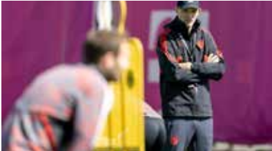
Tuchel feels all the pressure will be on the Manchester side. "Tomorrow, we will have the role of the underdog and that is okay. We have to stay confident and stay on top of our game," Tuchel told reporters on Monday. When asked how Bayern would deal with City, Tuchel said: "Pep's teams always have his own unique style. We will try to find ways of competing both with and without the ball."

MUNICH (Agencies): Bayern Munich will be considered as underdogs when they face Manchester City in the first leg of their Champions League quarterfinal at Etihad Stadium on Tuesday, manager Thomas Tuchel said. In his most challenging match since taking charge of the Bundesliga club last month, the German manager will be hoping to pull off another win over City having guided his former club Chelsea to the Champions League title with victory over Pep Guardiola's side in the 2021 Champions League final. Bundesliga leaders Bayern have won the Europe's premier club competition six times whereas City are still hunting for their first, but despite that record