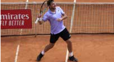
said 2014 champion Wawrinka, the oldest man in this year's field. "In the first round you need to find your game. The first match on clay is never easy against a good player. I'm happy to get through. It was important to fight until the end." Up next for the three-times Grand Slam champion is world No 10 Taylor Fritz. "He's an amazing player," Wawrinka said of the American. "He's top 10, been winning a lot of matches. Winning a lot of tournaments. He's very dangerous on many surfaces."

MONTE CARLO (Agencies): Former champion Stan Wawrinka rolled back the years to outlast Tallon Griekspoor 5-7, 6-3, 6-4 and reach the Monte Carlo Masters second round today while Andy Murray's first appearance in the tournament since 2017 ended in a loss to Alex de Minaur. Wawrinka looked in danger of falling in his opener for a second straight year after losing a tight opening set, but the 38-year-old found a way back into the match by dominating the second and grabbed an early break in the decider. Griekspoor beat Wawrinka in their only previous meeting in 2018 and showed plenty of fight to level at 3-3 but surrendered his serve again to allow the Swiss veteran to surge ahead and close out the contest on his sixth match point. "It was really important to stay calm with myself,"